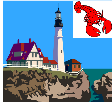
Portland Head Lighthouse