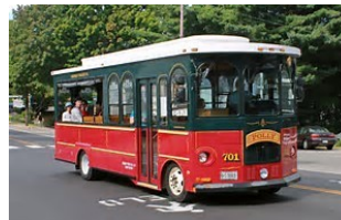
TROLLEY around Ogunquit, Maine