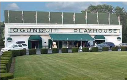
THE OGUNQUIT PLAYHOUSE Ogunquit, Maine

Cancellation Protection For only $39 at SIGN UP