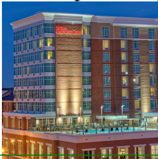
Hilton Garden Inn Downtown NASHVILLE

For More Information: (413) 732-8687 1-888-320-8687 mike@travelgrouptrips.com www.travelgrouptrips.com