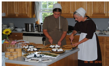
Dinner is a real Amish Home